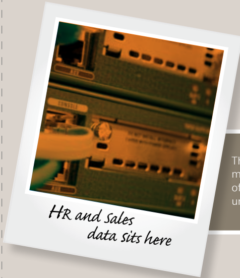
HR and Sales data sits here

BMC Atrium brings it all together by providing a shared set of enabling technologies that provide a single, federated configuration management database (CMDB), a business service model, and common views of IT. BMC Atrium lets you discover, connect, automate, optimize, analyze, and report on your IT enterprise — and see how it impacts your business.