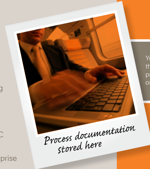
Process documentation stored here

The applications server that might (or might not) contain all of your HR and Sales data (well, unless you've moved it)